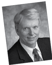
*JEFF SUTHERLAND Scrums grand old man, Co Founder of Scrum